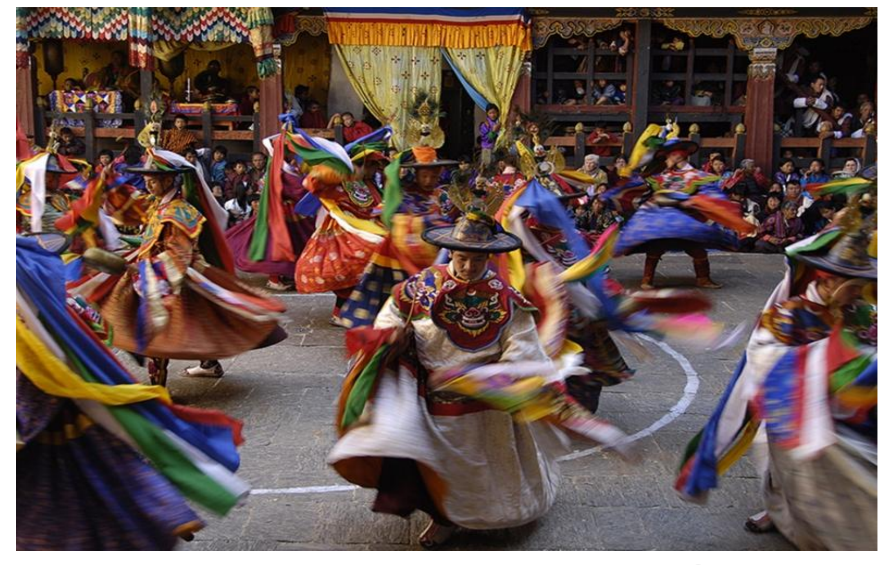
Traditional Bhutanese Cultural festival